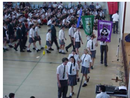
Year 12 Graduation Assembly