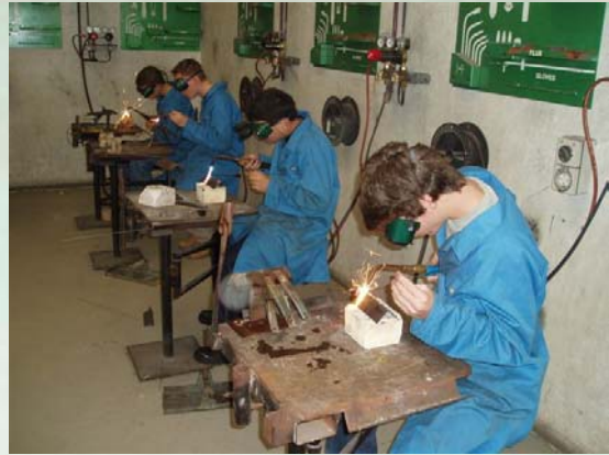
Our students at work at Midland TAFE