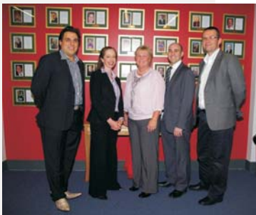
Congratulations to the Hall of Excellence inductees presented at the Induction Dinner on Friday 3 September.