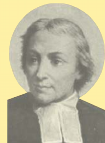
St John Baptist de La Salle