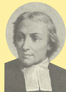
St John Baptist de La Salle