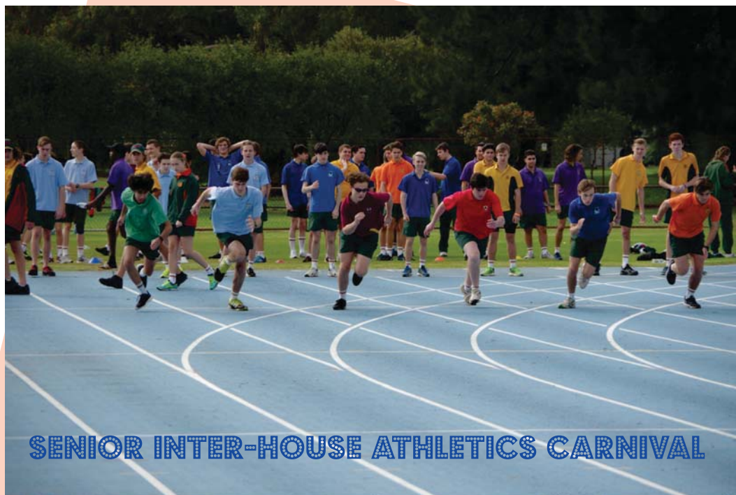
SENIOR INTER-HOUSE ATHLETICS CARNIVAL