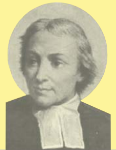
St John Baptist de La Salle