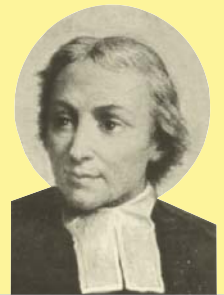
St John Baptist de La Salle

22 October 2016 Term 4 Week 2 Delagram 16