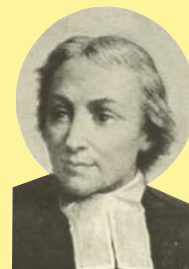
St John Baptist de La Salle

La Salle College - A Diamond In The Swan Valley