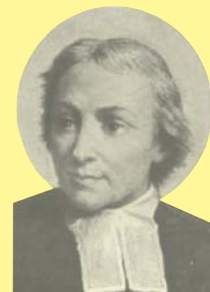
St John Baptist de La Salle

La Salle College - A Diamond In The Swan Valley