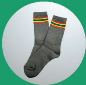
Grey College Socks