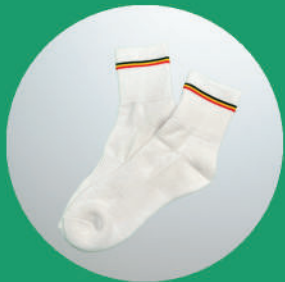
White College Socks